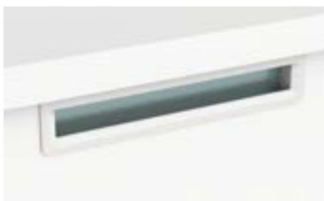
Interpret - horizontal