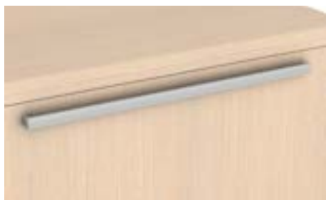
Chronicle Extended – drawers