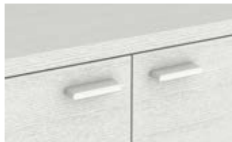
Emote - hinged doors