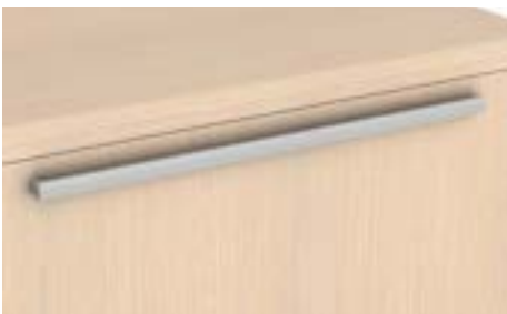
Chronicle Extended – drawers