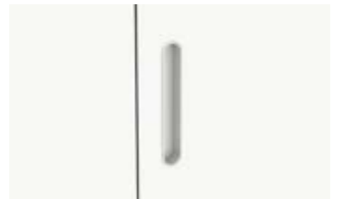
Cityline Recessed - vertical