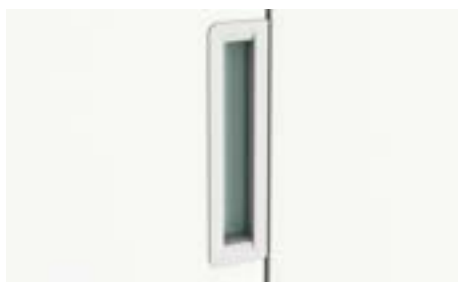
Interpret - vertical