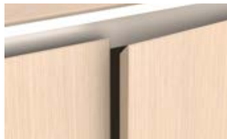
C+D Integrated Finger