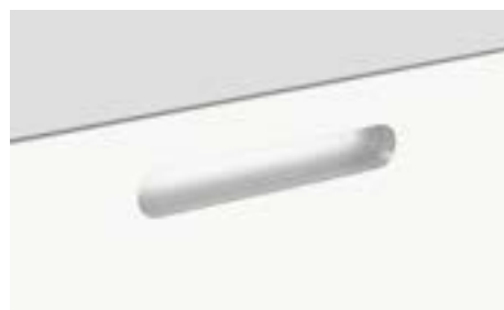
Cityline Recessed – horizontal