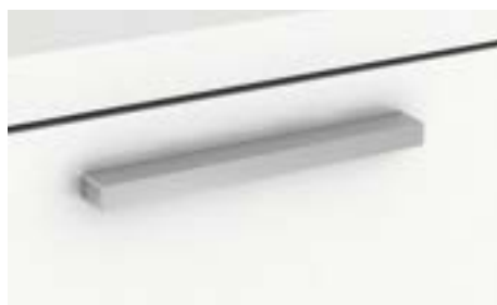
Rectangular – metal front