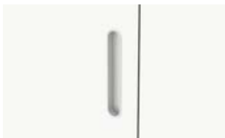
Cityline Recessed - vertical