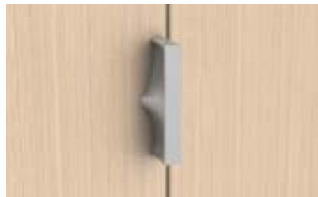
District - vertical