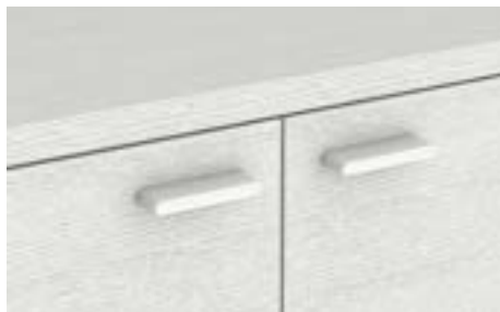
Emote - hinged doors