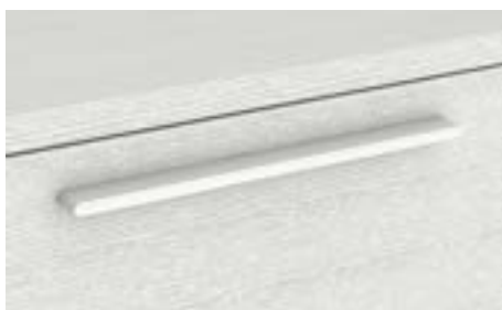
Emote - drawers