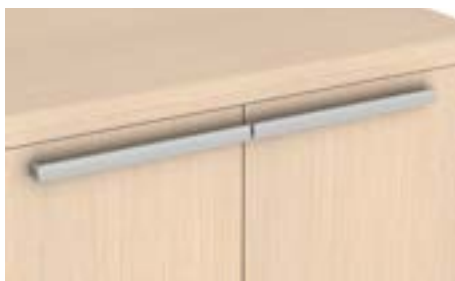
Chronicle Extended – hinged doors