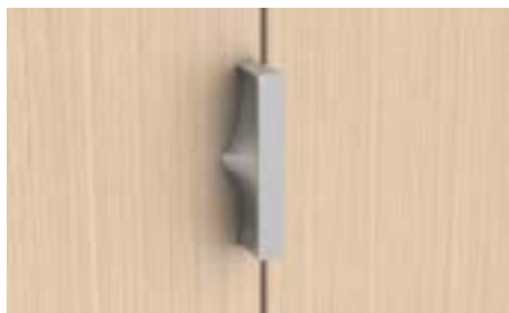
District - vertical