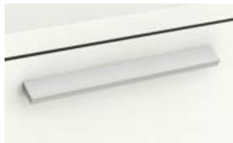
District - horizontal metal front