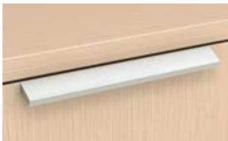
District - horizontal wood front