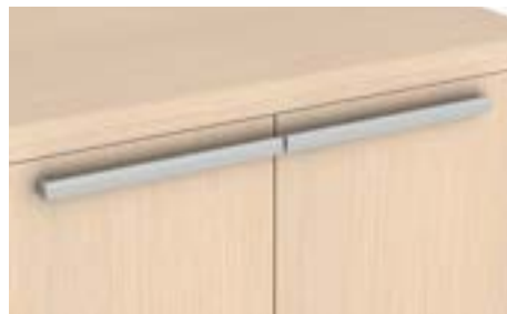
Chronicle Extended – hinged doors