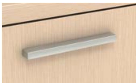
Rectangular – wood front