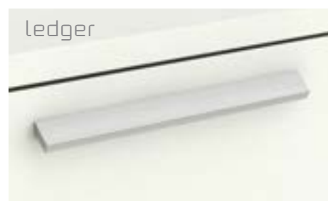
District - horizontal metal front