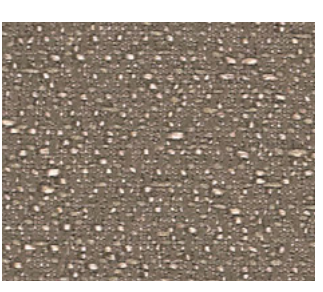
Porto Velho 1004-07