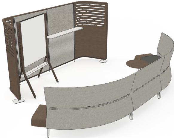
Dual Upholstery Shown