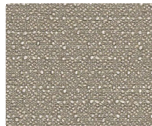
Earth Orbit 1007-07