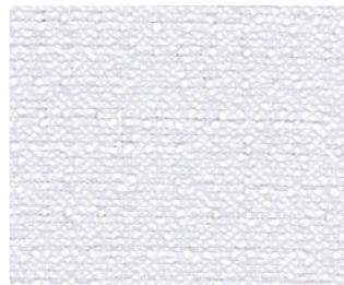
White Space 1007-02