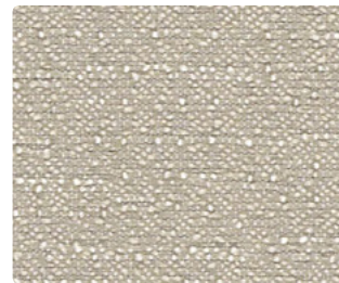
Reed Arrow 1007-04