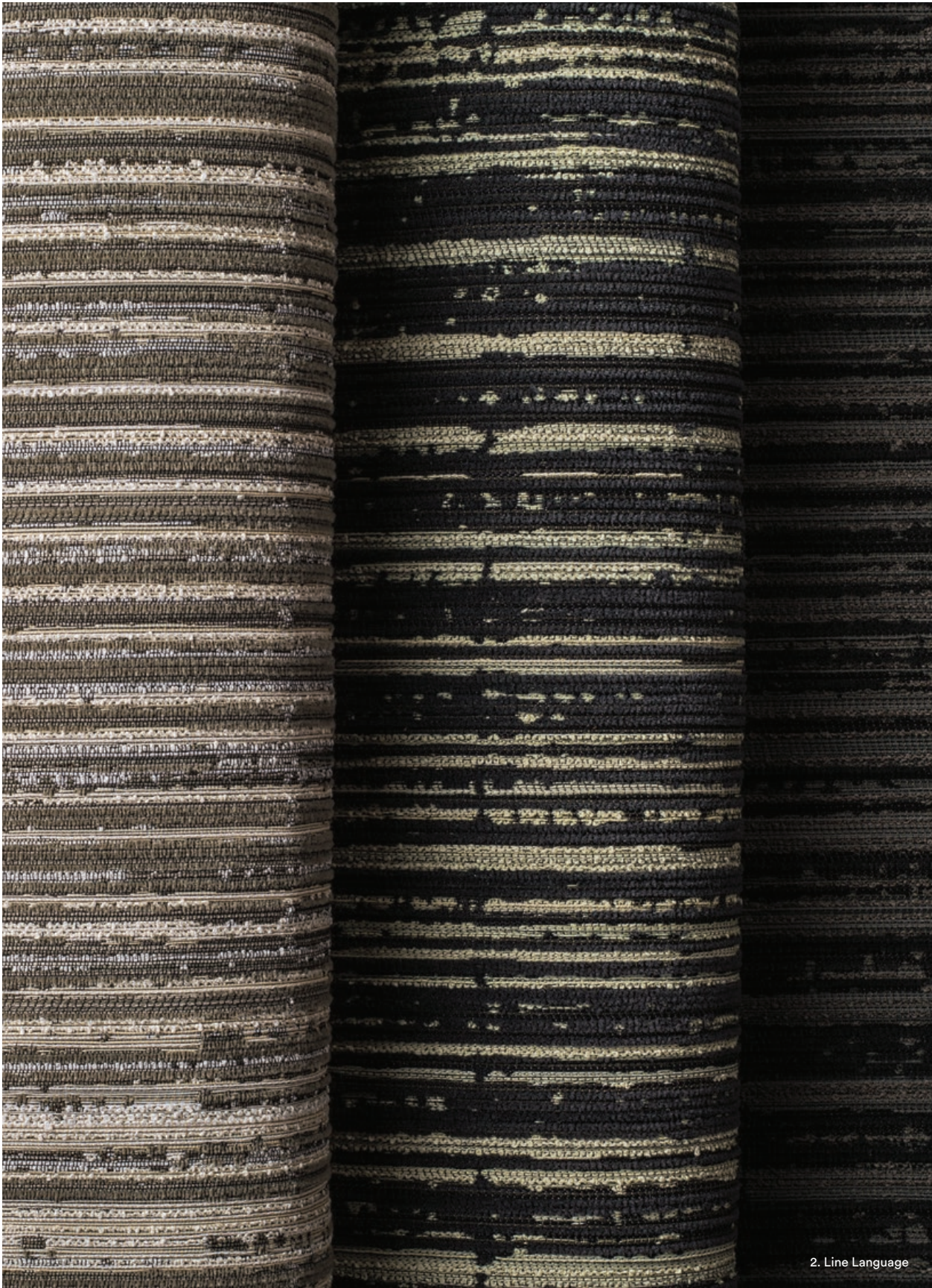
2. Line Language