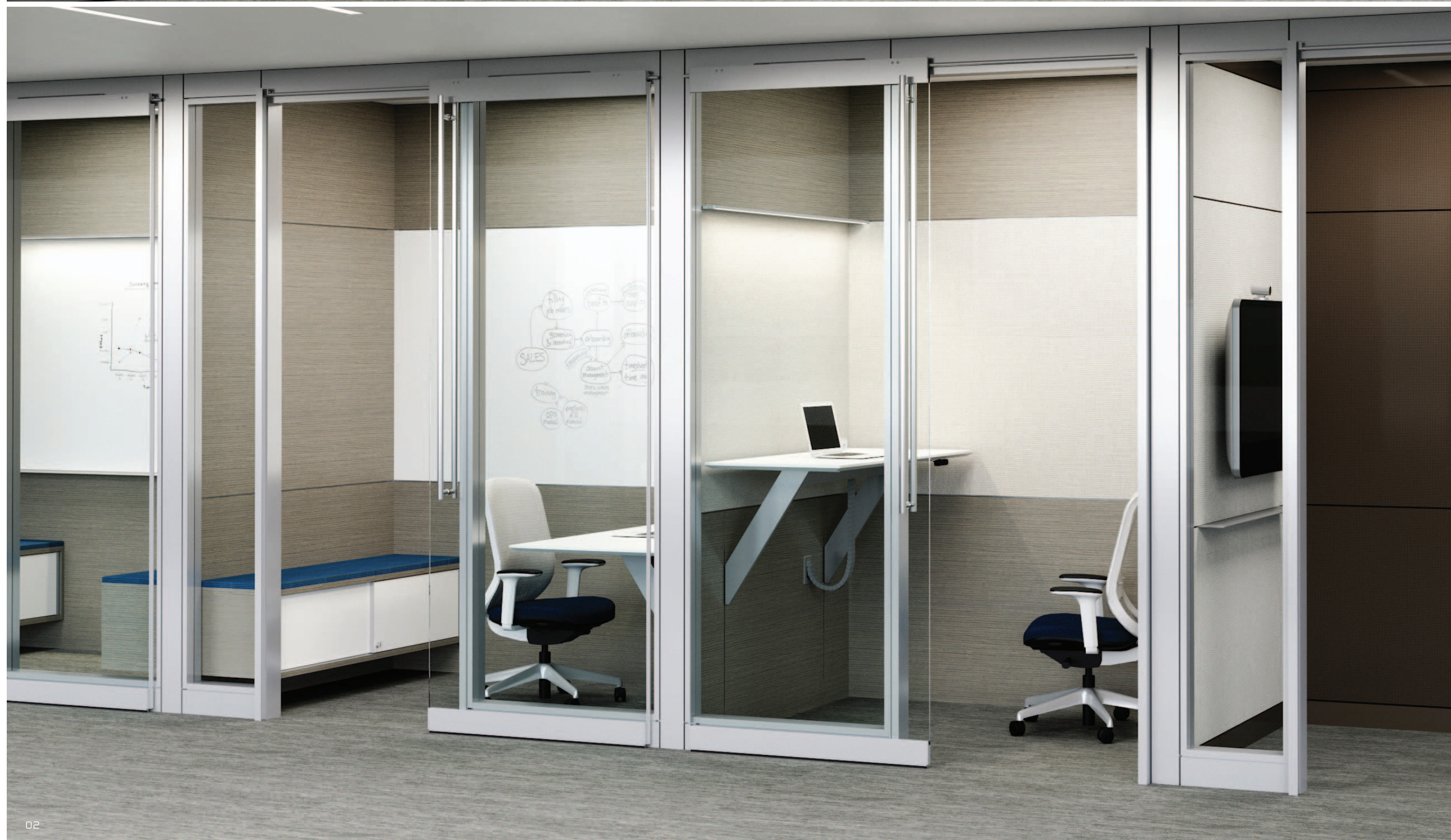
01 Altos Landscape enables horizontal planning with a collection of wall-integrated furniture.

Paint finishes are available at the same price point as the anodized finish, and with standard lead times.