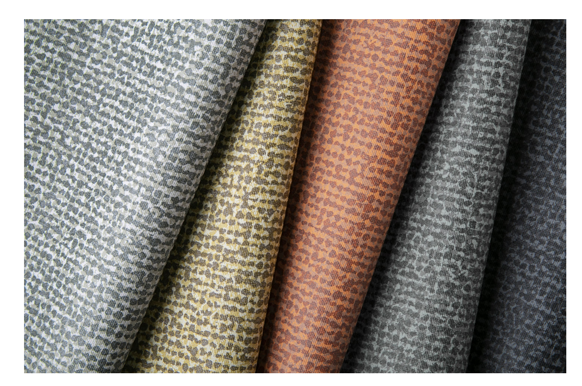
3. Meta Texture