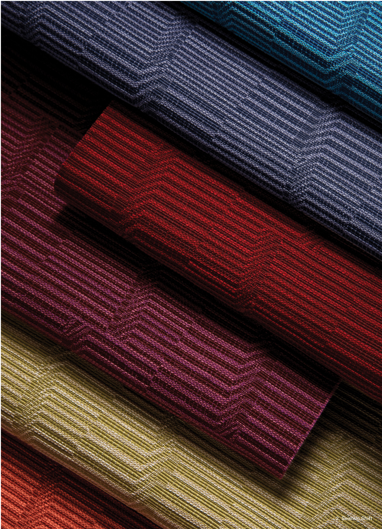
2. Seismic Shift