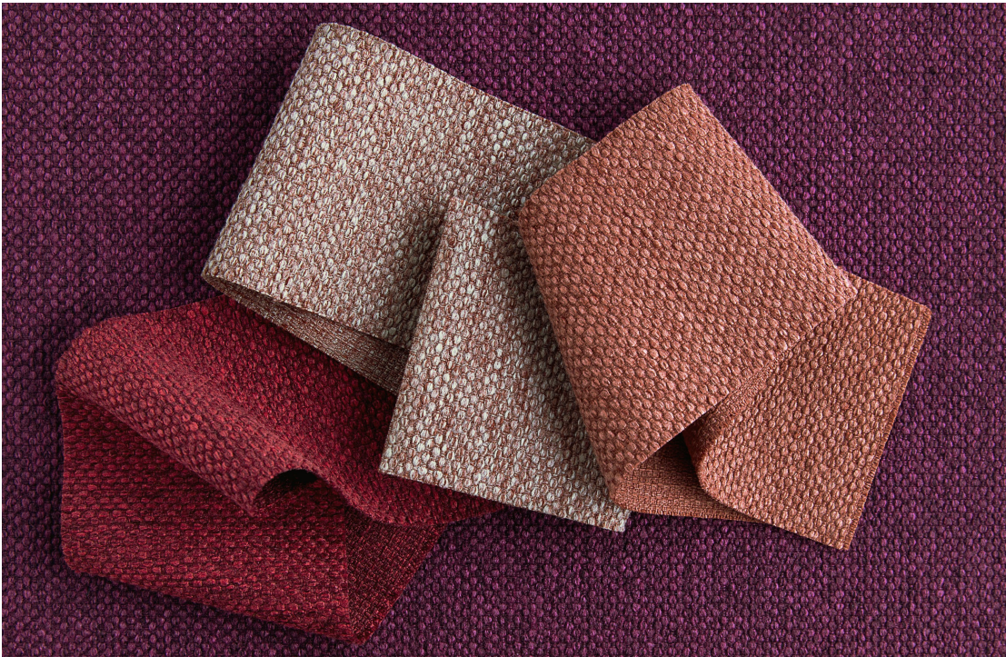
4. Digi Tweed