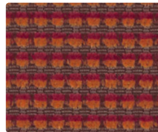
The Beat 4016-10