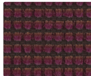
English Rose 4016-07