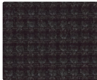
Black Vinyl 4016-08