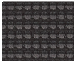
Mod Suit 4016-05