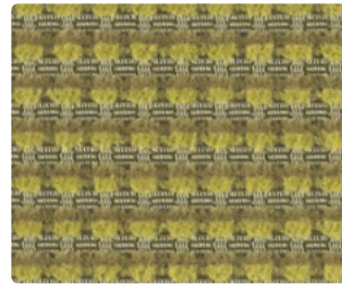
New Wave 4016-03