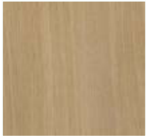
Campus Oak wo (LPL)