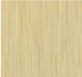
Bamboo UL (HPL)