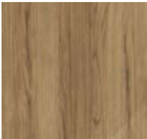
Vintage Oak 1D (LPL)