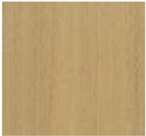
Campus Oak Ys (HPL)