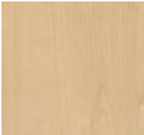
Murnau Maple UJ (HPL) X8 (LPL)