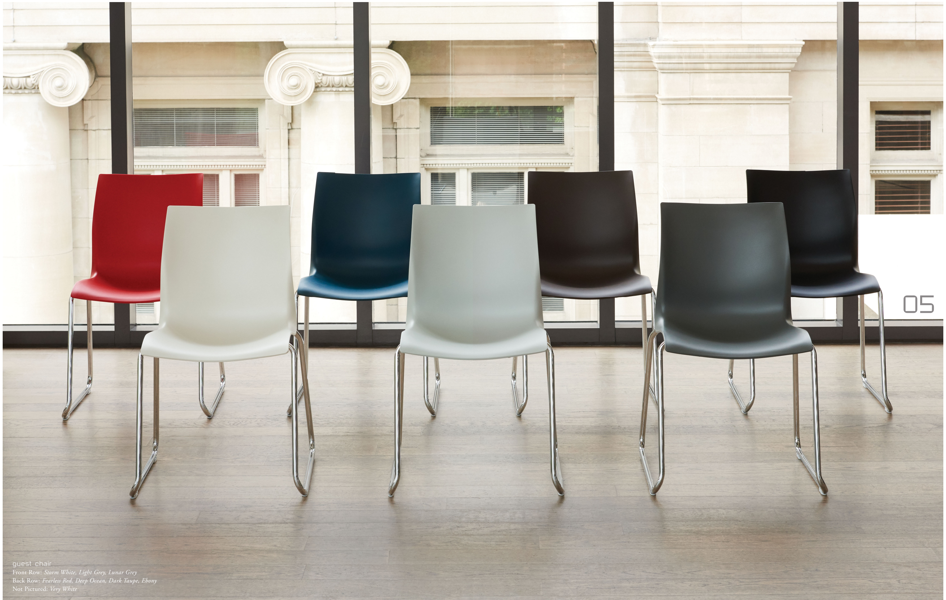
guest chair Front Row: Storm White, Light Grey, Lunar Grey Back Row: Fearless Red, Deep Ocean, Dark Taupe, Ebony Not Pictured: Very White