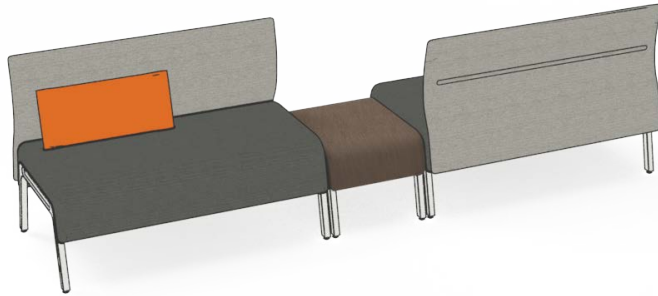
Dual Upholstery Shown