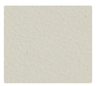
White Birch 4023-02