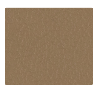
Almond Shell 4023-05