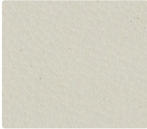
White Birch 4023-02