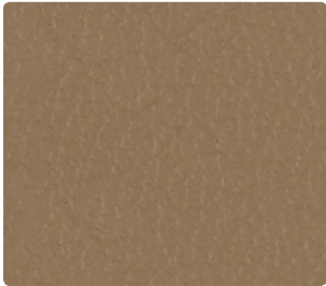
Almond Shell 4023-05