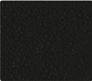
Black Truffle 4023-14