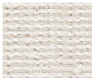
Pale Onyx 7013-07