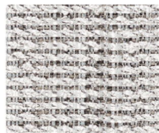
Tumbled Marble 7013-03